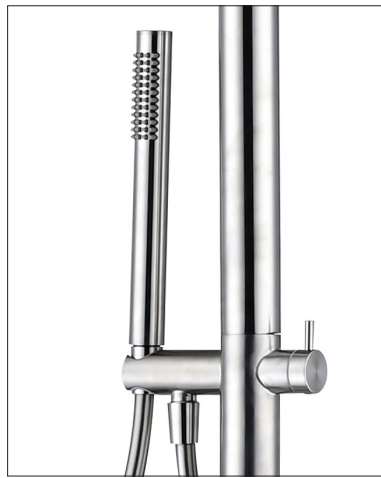
GPF008/AC flow rate L/MIN